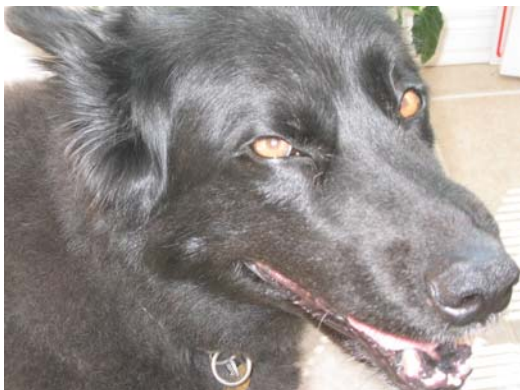
Our Mascots Maggie and Mitzi

Licensed Veterinarians are awarded the Diploma in Veterinary Homeopathy DVetHom .